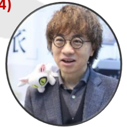
しんかい まこと 新海 誠