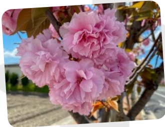
Yaezakura It has more than 6 petals