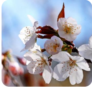
Yamazakura Japan's native 5 petal sakura