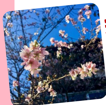
Shikizakura This one blooms in autumn also