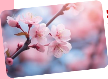
Somei Yoshino Most common 5 petal sakura