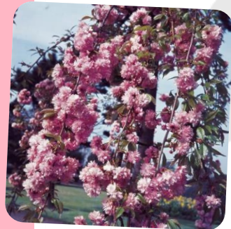
Shidarezakura The sakura tree with drooping down branches