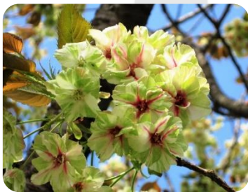
Gyoiko Yellow sakura